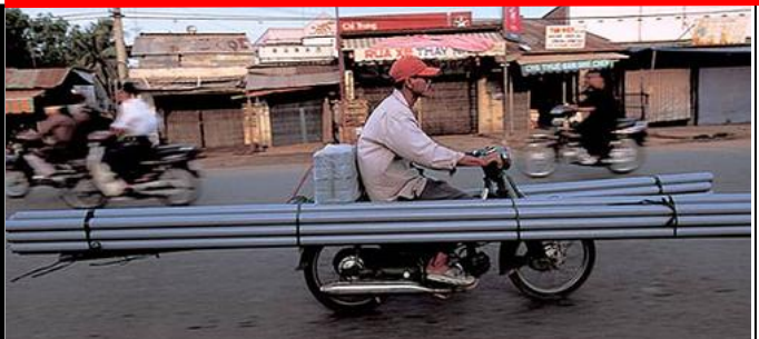
Above: would that be legal here!? Imagine doing a U-turn?