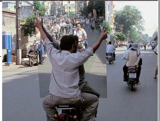
Right: OMG - it's a glass mirror! And we worry about crashing - imagine what would happen here!