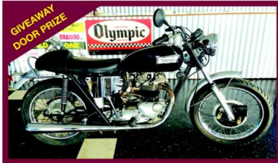
This Triumph 650 motorcycle is the giveaway door prize at the 2015 Laidley Swap. You must be present with a single armband on and I.D. to win this prize. Drawn at 11am Sunday 25th October.